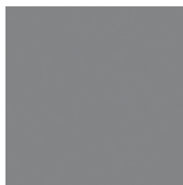
Aluminium Silver Metallic