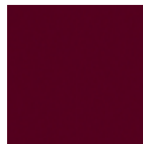
Burgundy Red Mica