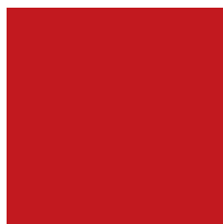
True Red Solid

Please refer to the full Mazda2 brochure for detailed technical specification. *Steering wheel handsfree Bluetooth® upgrade available at extra cost – please consult your dealer for further details. **Available as a free accessory. Features a 2-year Parrot warranty. The Bluetooth® word mark and logos are owned by the Bluetooth SIG, Inc. and any use of such marks by Mazda Motor Company is under licence. Other trademarks and trade names are those of their respective owners.